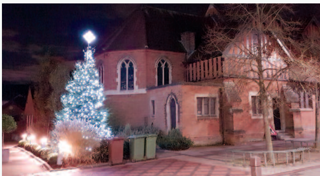
Christmas Lights, All Saints Church