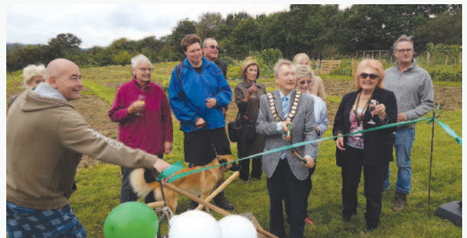
Stapleton Gardens Opening

Planning and Consultations: The council considered a total of 364 planning applications referred to it by Hertsmere Borough Council as a statutory consultee. Comments were made on 93 of these with concerns including issues of tower block developments, problems with smaller unit developments failing to meet local needs for family sized homes, highways infrastructure and potential basement developments negatively impacting the water table. Members also raised concerns over the high levels of retrospective applications locally. Consultation responses were made on the Hertsmere Local Plan (Planning for Growth), Local Council Tax Support Scheme and the Electoral Review of Hertsmere.