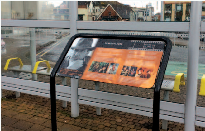
Harrison Ford Film Plaque

Site and Street Maintenance: In partnership with local businesses, the Council maintains the film plaques in Borehamwood, 47 benches and 10 notice boards. Both War Memorials, St Nicholas and All Saints Churchyard (and Church Clocks) are maintained by the grounds team and the High Street planter cost is shared with Hertsmeire Borough Council.