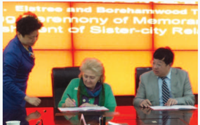
China Sister Town Signing

China Sister Town: The council signed a memorandum of understanding with Huainan in China in order to promote business links and for cultural and friendship contacts to be formed.