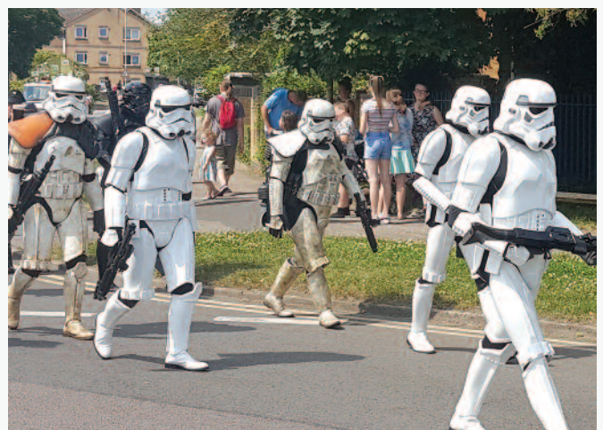
Civic Festival Parade