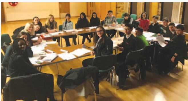
Youth Council 2017

Youth Council: With 20 active Youth Councillors, this group continues to represent and be a voice for young people in the local area and carries out community service work and environmental improvements. Work undertaken during the year included 'Urban Angels' homelessness initiative, 150 Years of Railways project, 'Make a Difference' (a 'Dragon's Den' style ideas community initiative), Youth Councillor training and working with the Borehamwood Times to develop writing skills.