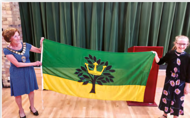
New town flag

Fireworks night: Fireworks night returned to Meadow Park with a bang celebrating the music of James Bond films. The event was attended in a safe environment by some 5,000 residents/visitors (the only free on entry fireworks display in the local area of this size).