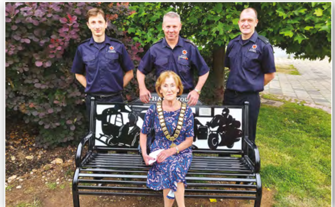
Thank You bench

Site and street maintenance: The council maintains the film plaques in Borehamwood, 56 benches and 10 notice boards. Both war memorials, St Nicholas and All Saints churchyard (and church clocks) are maintained by the grounds team. A dedicated bench to keyworkers to thank them for their work during the height of the pandemic was unveiled by the mayor adjacent to the Tesco's roundabout.