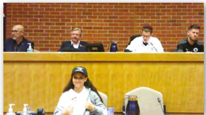
Youth Council Question Time