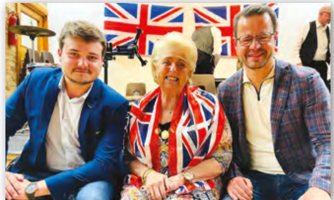
Deputy Mayor of Fontenay-Aux-Roses Esteban Le Rouzes, Town Mayor Cllr Sandra Parnell & Lord Mayor of Offenburg Marco Steffens

Grants: In 2022/23 the Town Council was proud to have assisted the following organisations with grant awards (or CIL expenditure) to contribute to the cost of local activities which are of benefit to the community (or a section of it):