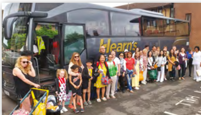
Free NHS Coach Trips