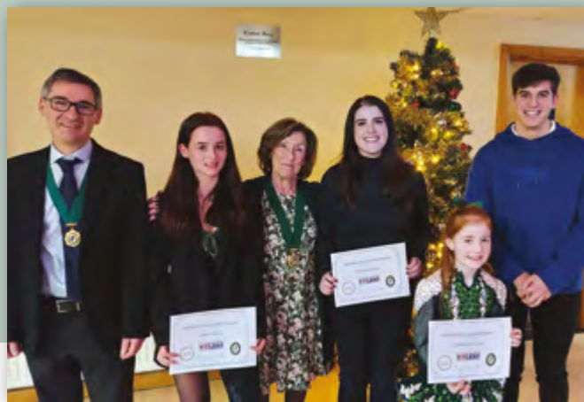
Elstree & Borehamwood's Got Talent Show