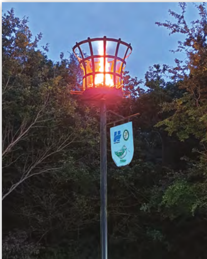
Jubilee Beacon Lighting